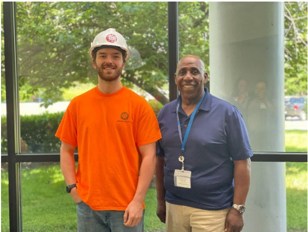
Church & Dwight's first Maintenance Apprentice

During the 1st quarter, our Business Solutions Team held 6 job fairs that served 109 businesses and 982 career seekers. In addition, we partnered with Church & Dwight and Eaton Corp to launch their first apprenticeships.