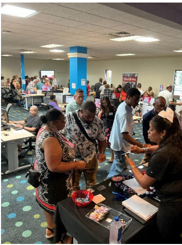
Henrico Center Job Fair